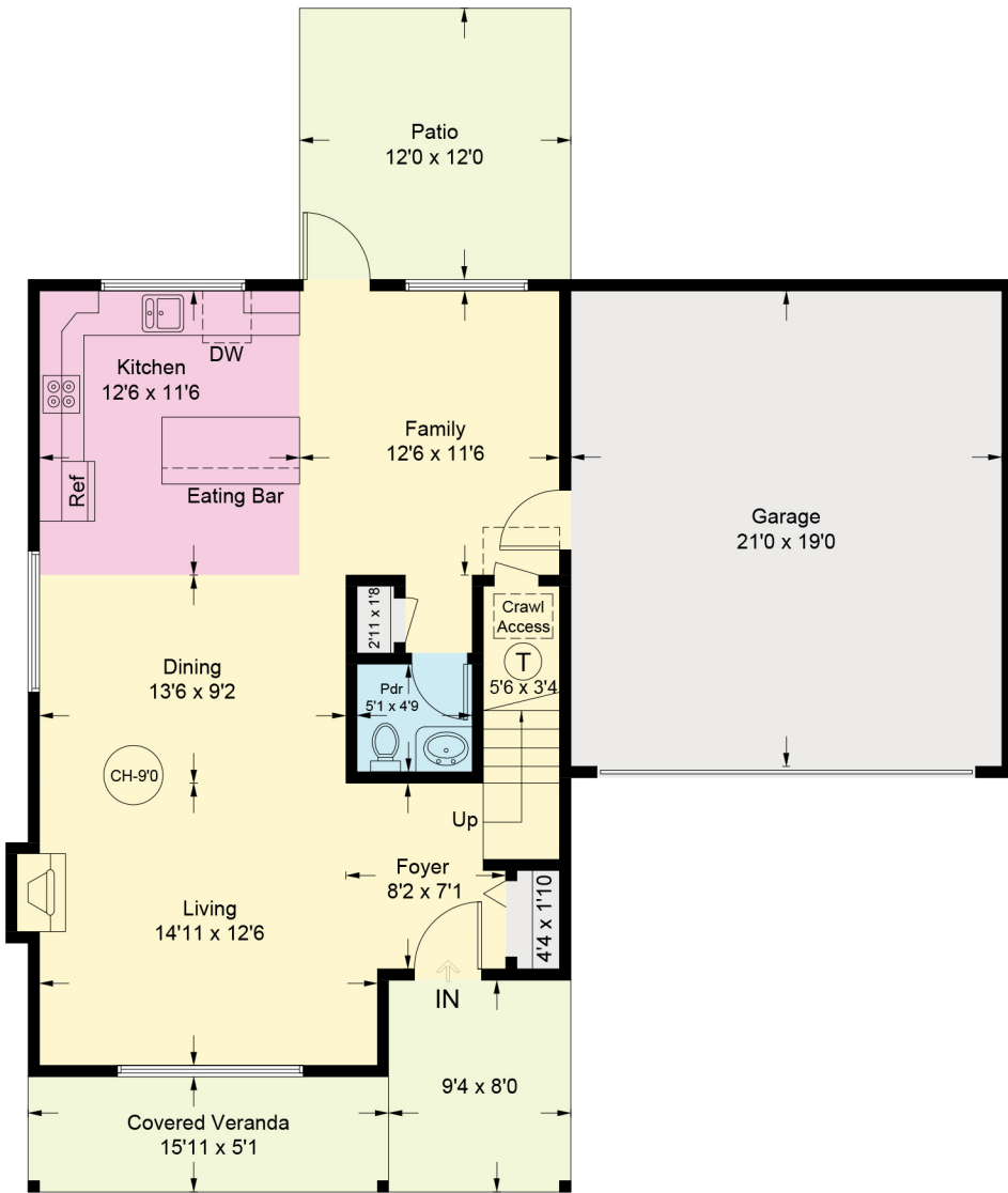
Main Floor - 806 sq ft